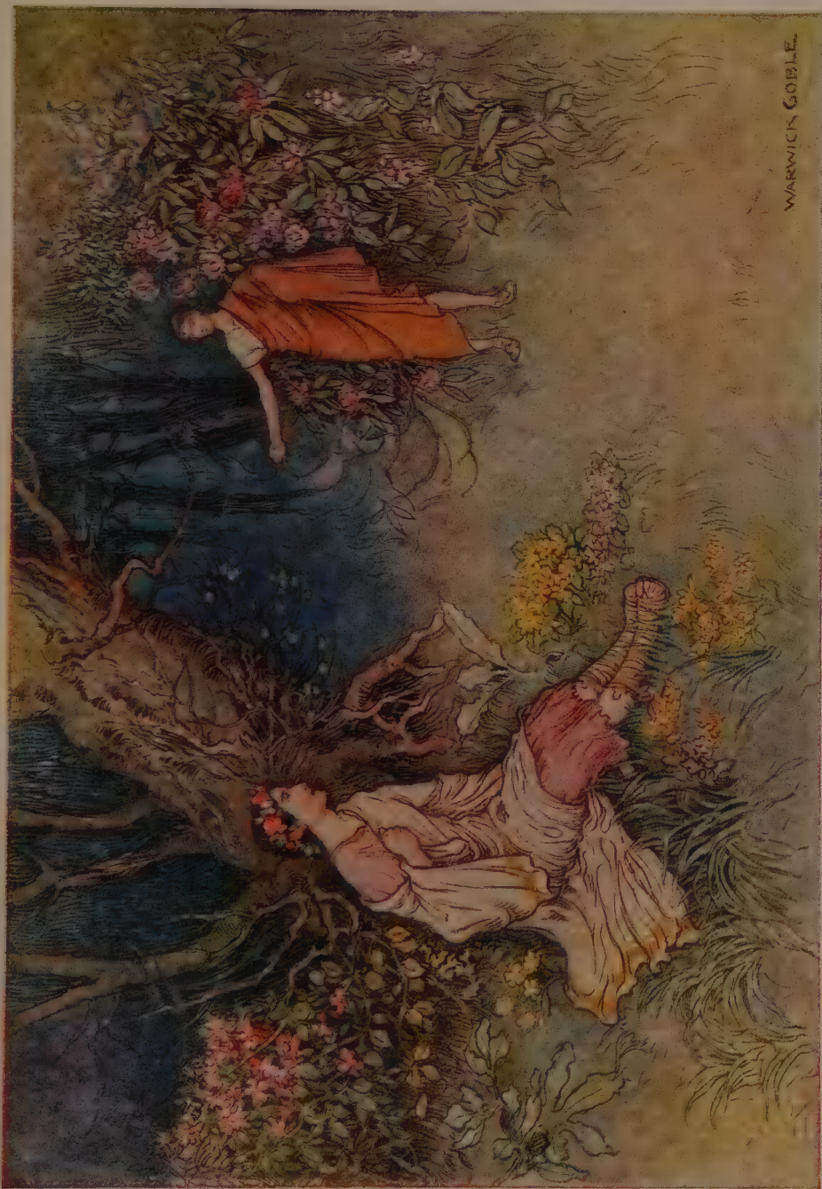
THE MEETING IN THE WOOD